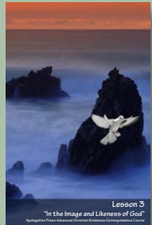
Lesson 3 "In the Image and Likeness of God" Apologetics Press, Answers in Christian Discovery, Evangelical Correspondence Course