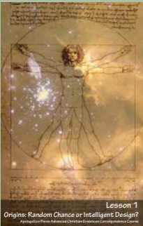
Lesson 1 Origins: Random Chance or Intelligent Design? Apologetics Press, Answers in Christian Discovery, Evangelical Correspondence Course