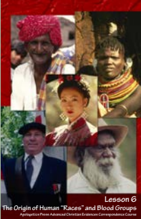
Lesson 6 The Origin of Human "Races" and Blood Groups Apologetics Press, Answers in Christian Discovery, Evangelical Correspondence Course