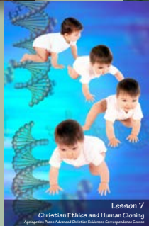
Lesson 7 Christian Ethics and Human Cloning Apologetics Press, Answers in Christian Discovery, Evangelical Correspondence Course