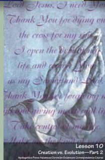
Lesson 10 Creation vs. Evolution—Part 2 Apologetics Press, Answers in Christian Discovery, Evangelical Correspondence Course