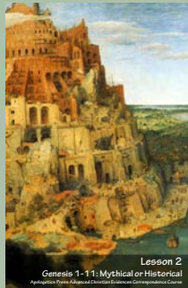
Lesson 2 Genesis 1-11: Mythical or Historical? Apologetics Press, Answers in Christian Discovery, Evangelical Correspondence Course