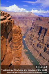
Lesson 4 The Geologic Timescale and the Age of the Earth Apologetics Press, Answers in Christian Discovery, Evangelical Correspondence Course