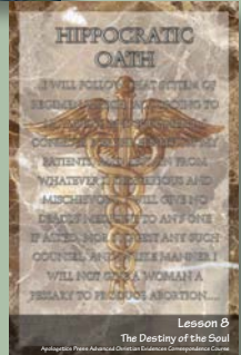
Lesson 8 The Destiny of the Soul Apologetics Press, Answers in Christian Discovery, Evangelical Correspondence Course