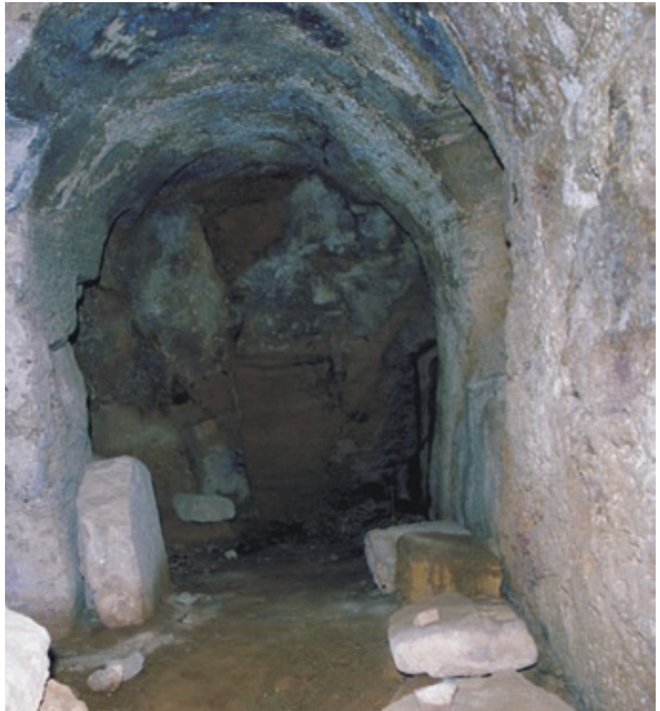
Christians do not serve a lifeless lord, but a Risen Redeemer Whose tomb was found empty nearly 2,000 years ago.

Third, Jesus’ resurrection is more significant than any other because He prophesied numerous times that He would rise from the dead, even foretelling the exact day on which it would occur. Jesus told