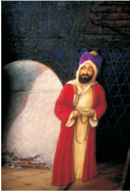
Artist's conception of Muhammad.

home, a hapless journey's end. Allah citeth an example for those who disbelieve: the wife of Noah and the wife of Lot, who were under two of our righteous slaves yet betrayed them so that they (the husbands) availed them naught against Allah and it was said (unto them): Enter the Fire along with those who enter. And Allah citeth an example for those who believe: the wife of Pharaoh when she said: My Lord! Build for me a home with thee in the Garden, and deliver me from Pharaoh and his work, and deliver me from evildoing folk; And Mary, daughter of 'Imran, whose body was chaste, therefore We breathed therein something of Our Spirit. And she put faith in the words of her Lord and His Scriptures, and was of the obedient ( Surah 66).