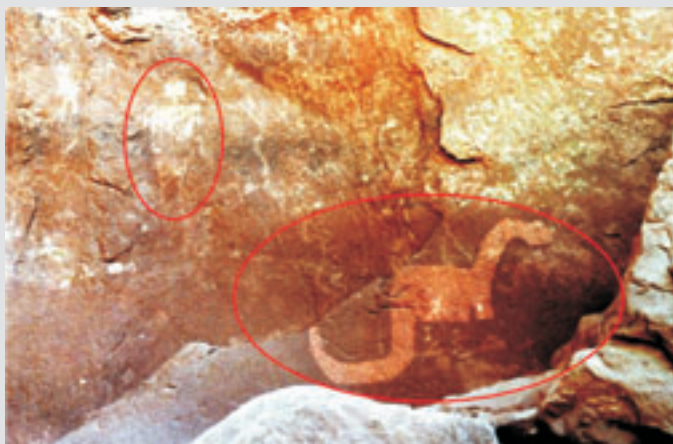
To help you see the image, we have enhanced the color of certain portions and circled both the human figure in the upper left-hand section and the dinosaur figure to the right.

At the base of Kachina Bridge are approximately one hundred elements, both petroglyphs and pictographs, dating from A.D. 700-1250. These include a series of red handprints and a large red butterfly-like figure, spirals, bighorn sheep, snake-like meandering lines, a white pictograph of a chain-like design, and some geometric petroglyphs.... One of the most curious designs is a petroglyph that resembles a dinosaur, which is apparently Anasazi origin based on its patination (2000, p. 105).