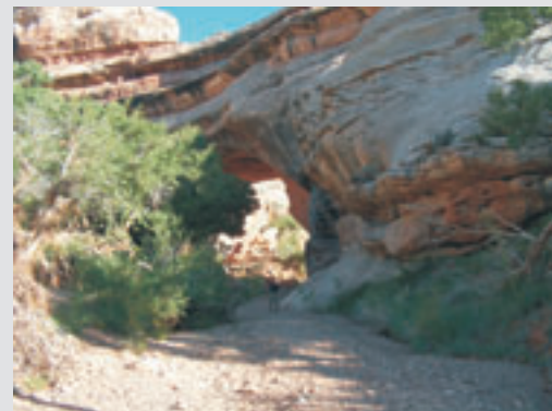
Seen here from several hundred feet away, the Kachina Natural Bridge is the third largest in the world.

The only other animal that the staff member at Natural Bridges National Monument seemed to think that the petroglyph in question could have been was a horse. But, according to her own testimony, the Anasazi Indians were a horseless people. (Spanish settlers did not introduce the horse to America until the late sixteenth century.) Thus, she concluded it is some kind of monster. This “monster,” however, looks exactly like the scientific reconstruction of the large sauropod dinosaur known as Apatosaurus . It is no wonder that this woman earlier admitted that scientists “don’t really want to explain” this petroglyph. They do not want to deal with it, because they cannot logically find a way to explain it away.