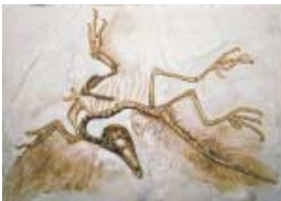
Archaeopteryx lithographica fossil

The story surrounding Archaeopteryx has been complicated by another discovery that has left evolutionists scratching their heads in regard to where, exactly, the creature actually fits in the evolutionary scheme of things. In 1986, Sankar Chatterjee and colleagues at Texas Tech University discovered the fossilized remains of two crow-sized birds allegedly 75 million years older than Archaeopteryx (i.e., approximately 225 million years old according to evolutionary dating methods) [see Beardsley, 1986; Chatterjee, 1991]. Chatterjee named the find Protoavis texensis (first bird from Texas), and has reported that the skull of Protoavis has 23 features that are fundamentally bird-like. In commenting on this, one author wrote in Science concerning Chatterjee's work: "His reconstruction also shows a flexible neck, large brain, binocular vision, and, crucially, portals running from the rear of the skull to the eye socket—a feature seen in modern birds but not dinosaurs" (Anderson, 1991, 253:35).