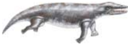
Artist's rendition of an "aquatic" Pakicetus