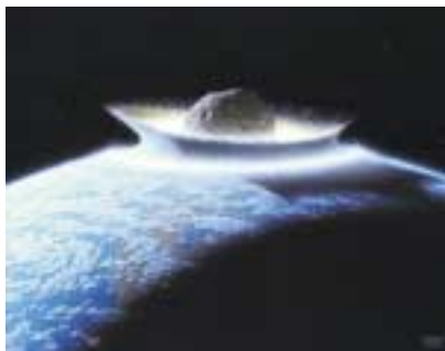
Graphic representation of asteroid impact that allegedly caused the dinosaurs' extinction.