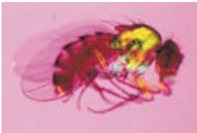
Hox genes play key roles in regulating body plans.