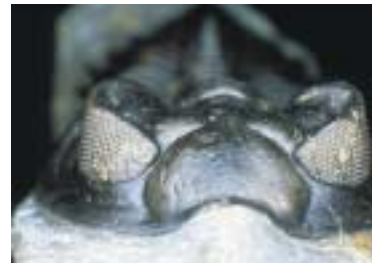
Magnified photograph of complex lens system in the trilobite’s calcite-based eye

sil record, where incredibly complex “early” structures and organisms suddenly appear fully formed and completely functional (such as the dual lens system and accompanying refractive interface of the trilobite’s eye). And so on. Then, of course, there is the oft-overlooked fact that Darwin’s “cast-iron logic” led him to advocate and defend the discredited concept of Lamarckianism (the idea that “acquired characteristics” can be inherited). So much for Darwin’s self-assured, cast-iron logic.