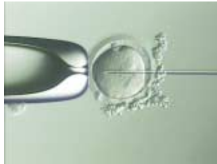
Micromanipulation of egg cell in preparation for cloning

transfer that genetic material into an egg cell whose nucleus has been removed (leaving the egg empty, but healthy). Upon realizing that it no longer is in a hostile environment, the body cell “wakes up” and begins to develop—having forgotten where it came from and what it was on its way to becoming. As it begins to grow once more, it creates a whole new organism. This new organism then will be an exact genetic duplicate of the original body cell from which it was taken. But is this a safe and normal method of reproduction? Ask yourself what happens to all of the embryos that scientists use as they try to get the procedure “up and running.” How many failed human clones will have to be produced before we realize how morally bankrupt such a procedure really is? [For a brief look at humanity’s future from an evolutionist’s point of view, see Peter Ward’s 2001 book, Future Evolution , pp. 139-153.]