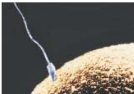
Photomicrograph of male sperm cell attempting penetration of female egg cell

What is that “purpose”? And how can evolution (via natural selection) explain it? Would “Nature” (notice the capital “N”) “select for” sexual reproduction? As it turns out, the common “survival of the fittest” mentality cannot begin to explain the high cost of first evolving, and then maintaining, the sexual apparatus. Sexual reproduction requires organisms first to produce, and then maintain, gametes (reproductive cells—i.e., sperm and eggs).