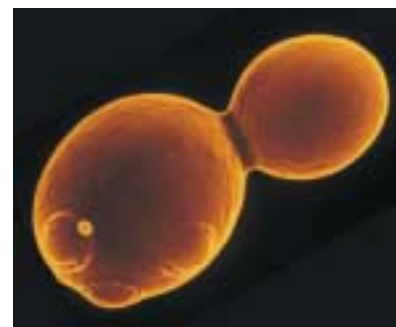
An example of the asexual reproduction process known as budding

Asexual reproduction is the formation of new individuals from cells of only one parent, without gamete formation or fertilization by another member of the species. Asexual reproduction thus does not require one egg-producing parent and one sperm-producing parent. A single parent is all that is required. Sporulation (the formation of spores) is one method of asexual reproduction among protozoa and certain plants. A spore is a reproductive cell that produces a new organism without fertilization. In certain lower forms of animals (e.g., hydra), and in yeasts, budding is a common form of asexual reproduction as a small protuberance on the surface of the parent cell increases in size until a wall forms to separate the new individual (the bud) from the parent. Regeneration is another form of asexual reproduction that allows organisms (e.g. starfish and salamanders) to replace injured or lost parts.