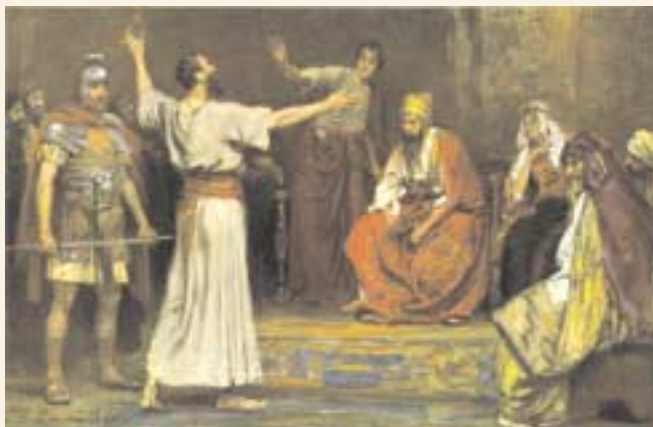
Artist’s conception of Paul before King Agrippa