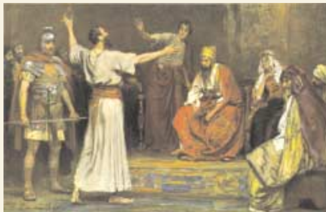
Artist’s conception of Paul before King Agrippa