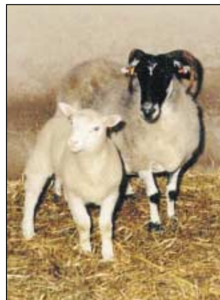
Dolly (cloned from a mammary gland cell of a Finn Dorset ewe) and her Scottish Blackface surrogate mother

Sheep, mice, cattle, goats, monkeys, and pigs are all mammals. Remember the definition of a mammal from your high school biology textbook? Mammals are animals that: