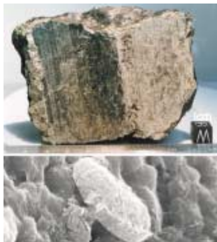
Top—Martian rock ALH84001; Bottom—scanning electron micrograph of alleged tube-shaped fossilized bacteria

The creationist is quick to remind evolutionists that biopoiesis [spontaneous generation—JD/BT] and evolution describe events that stand in stark, naked contradiction to an established law. The law of biogenesis says life arises only from pre-existing life, biopoiesis says life sprang from dead chemicals; evolution states that life forms give rise to new, improved and different life forms; the law of biogenesis says that kinds reproduce their own kinds (1976, p 182).